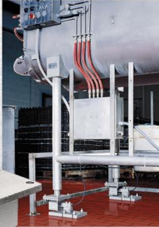
SBS Weight Sensor