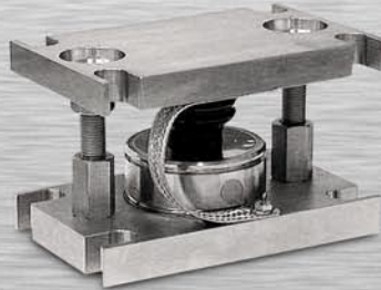
220 Tank Mount