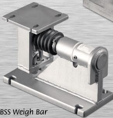
BSS Weigh Bar