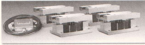
Available in configuration with three or four mounting assemblies.