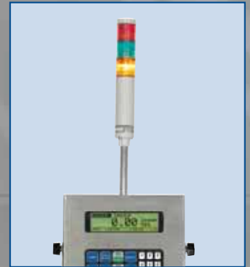
355, 465, & 562 Checkweigh Stacklight Kit Option