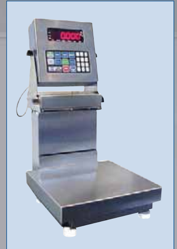
Intrinsically Safe Checkweighers available.